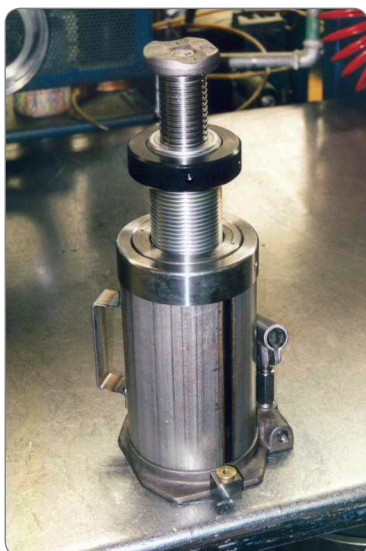
Bottle jack with lock nut