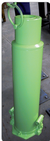
50 Tn, 2 speed, long stroke bottle jack