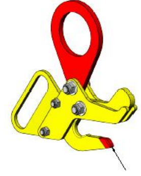
Red painted point

The hook opens automatically when laying down the load and the hook can be pulled of the eye (n° 4 and 5)